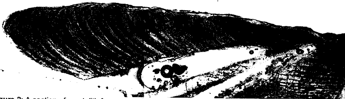
Figure 2: A section of an otolith from a carp from a lake in Minnesota.